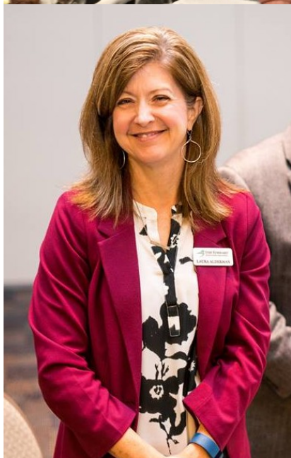
(Clockwise from top left)